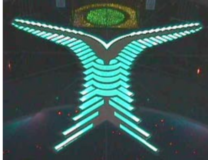
Unique Illuminated In-floor System

The ceilings of the main gaming floor have been dramatically transformed with the installation of lines of fibre optic lighting and new feature chandeliers, fitted with ‘colour dynamic’ projectors. The granite flooring in the Casino’s main entrance was renewed incorporating in-floor Fibre Optic Lighting utilizing new resin technology, providing a spectacular Brass Logo Lightbox feature.