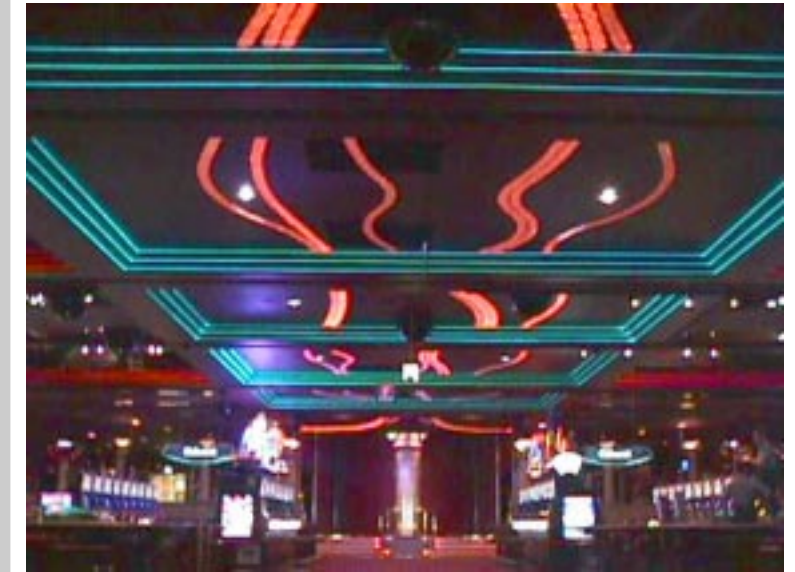
Gaming Room Ceiling

Externally the Entry Porte Cochere is a blaze of colourful floating coffers supported and suspended by columns crowned with wrap-around capitals of