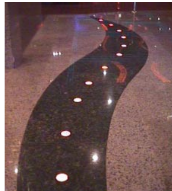
Illuminated Floor Dots