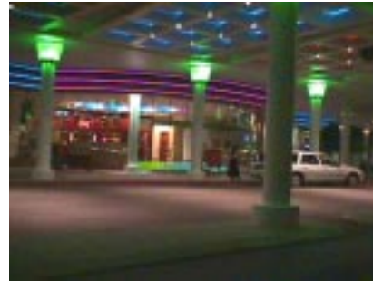
Distinctive Colonnade Illumination

Burswood International Resort Casino has become a world leader in the use of special lighting effects and state-of-the-art technology with a major lighting refurbishment of its main gaming floor and environs.