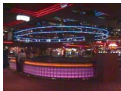
Glass Wall and Halo